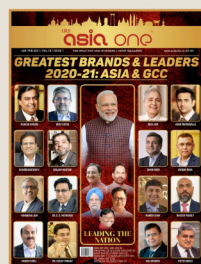
GREATEST BRANDS & LEADERS 2020-21