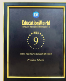
INDIA'S MOST RESPECTED EDUCATION BRAND