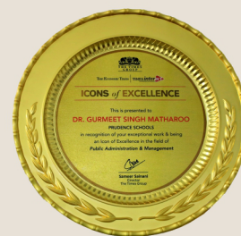
ICON OF EXCELLENCE BY TIMES GROUP