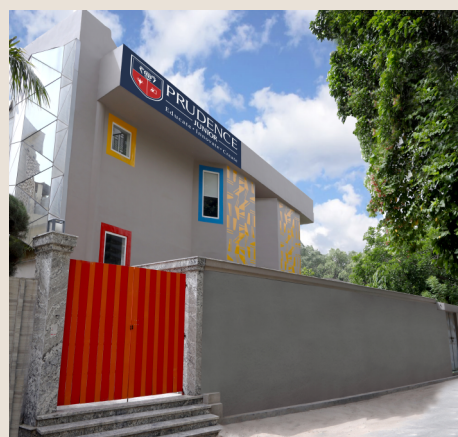
ASHOK VIHAR JUNIOR