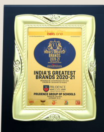
INDIA'S GREATEST BRANDS 2020-21