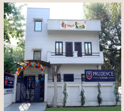
DWARKA SEC- 8