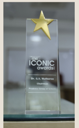
ICONIC AWARD 2020-21